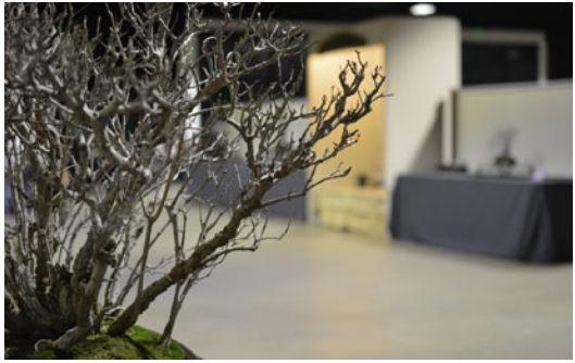
ELLEN KENESHEA Chinese Elm