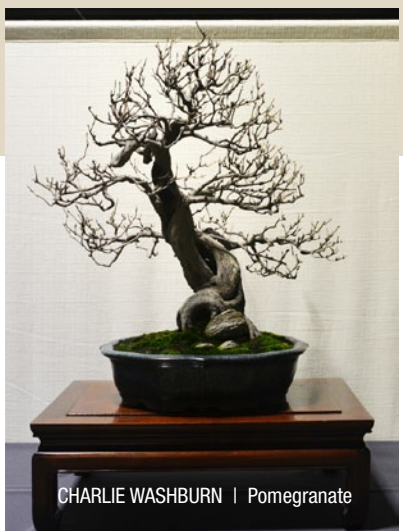
CHARLIE WASHBURN | Pomegranate